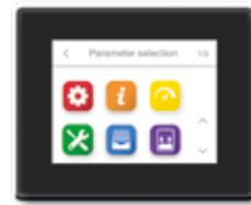
3,5" touch display