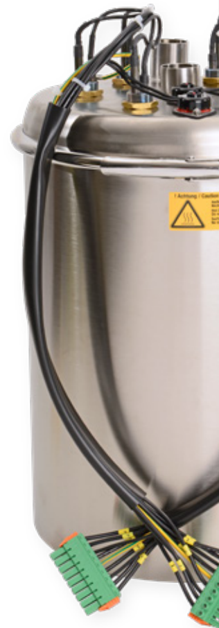
Large cylinder (FLP30 - FLP50)