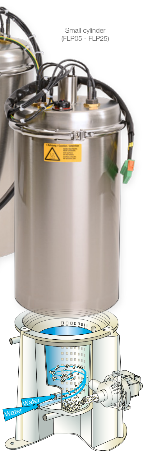
Integrated rinsing and lime collection system