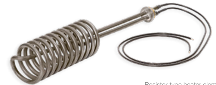
Resistor type heater elements in highly corrosion-resistant alloy

The heater elements are made of highly corrosion-resistant Incoloy825 (chrome-nickel-molybdenum alloy) and therefore extremely durable. The mechanical overheating protection of the heater elements together with the electronic proportional level control provide double protection.