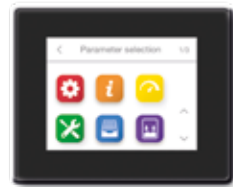
3.5" touch display