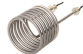
Resistor type heater elements in highly corrosion-resistant alloy