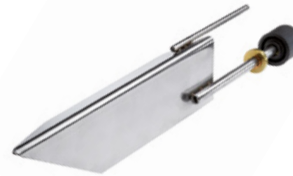
Replaceable stainless steel large area electrodes for different conductivities