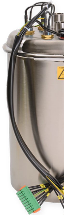
Large cylinder (FLP30 - FLP50)