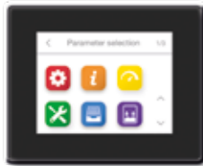
3.5" touch display

All HygroMatik FlexLine units are equipped with a capacitive 3.5" touch display. Operation and programming are selected via a flat and intuitive menu structure analogous to modern smartphone logic. In addition to this, subsequent software updates are quickly and easily possible via USB flash drive.