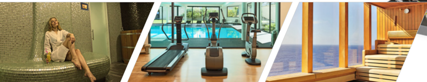
Spa resorts and wellness hotels

The basic FlexLine model is the basis for all other configuration options. Thanks to individual extension capability the FlexLine can be adapted to the differing applications in the spa and wellness sector.