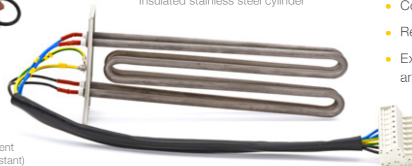
Heater element (corrosion-resistant)