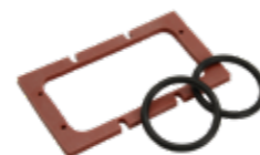
Seal kit for easy maintenance