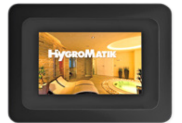
Spa Touch Control